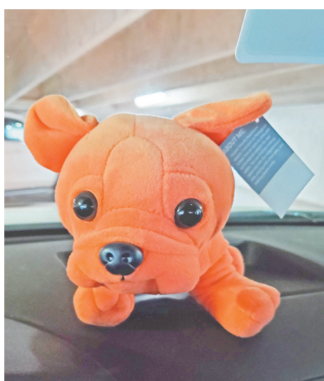
Luke the dog