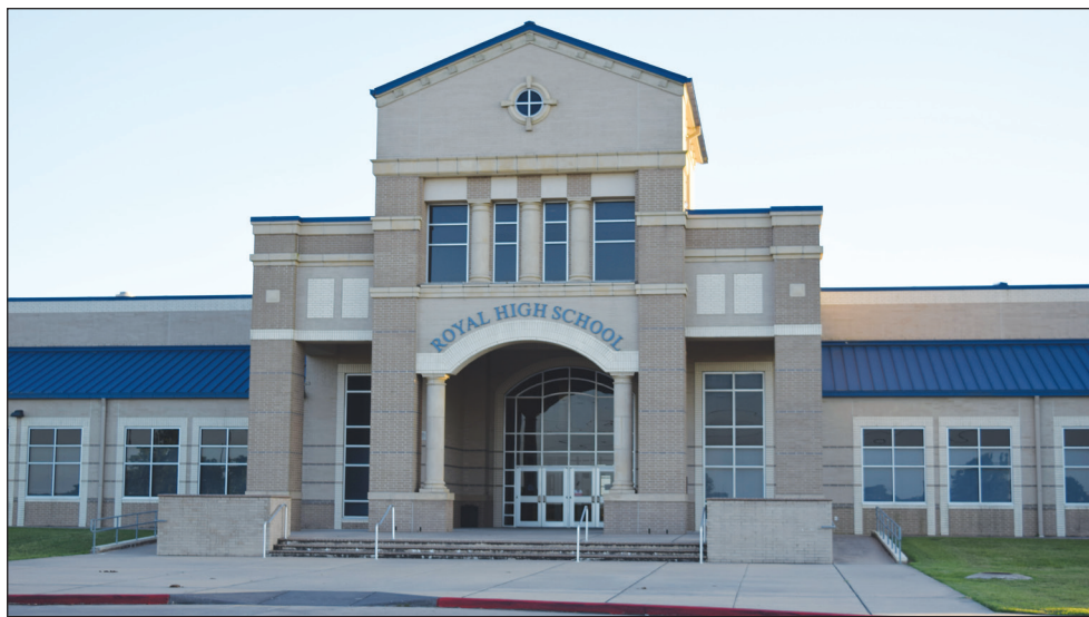
ROYAL HIGH SCHOOL BY R. HANS MILLER

Additional details will be sent out to parents as they are finalized, including those for IT or sports equipment returns, the district said.