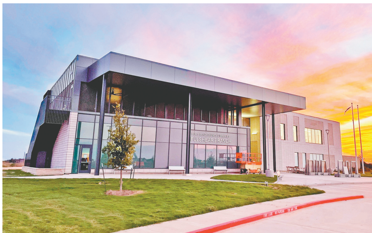
RENDERING COURTESY OF FORT BEND COUNTY LIBRARY SYSTEM

The new Fulshear Branch library -- which will be the third-largest library in the Fort Bend County library system -- will host its grand opening on Saturday, January 13th at 6350 GM Library Road off Texas Heritage Parkway, north of FM 1093, in Fulshear.