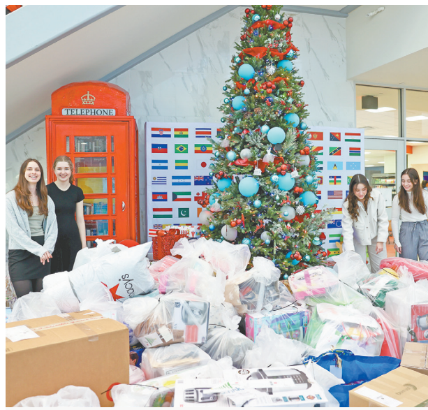
BRITISH INTERNATIONAL SCHOOL OF HOUSTON

Gifts gathered by seniors at the British International School of Houston benefitted over 120 families.