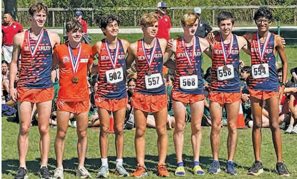
The Seven Lakes boys finished third at the District 19-6A meet.