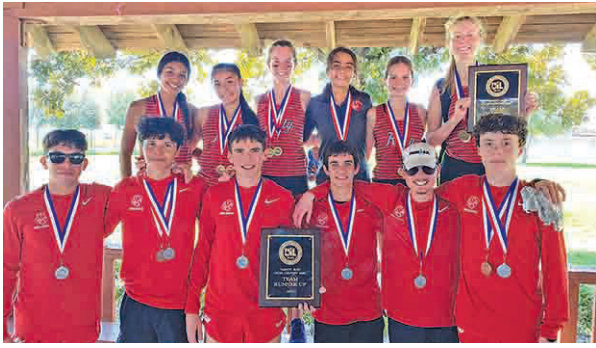
The Katy girls finished in first place and the Katy boys finished in second place at the District 19-6A meet.