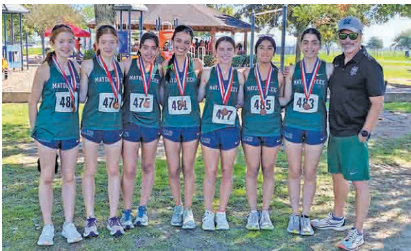
The Mayde Creek girls finished third at the District 19-6A meet.