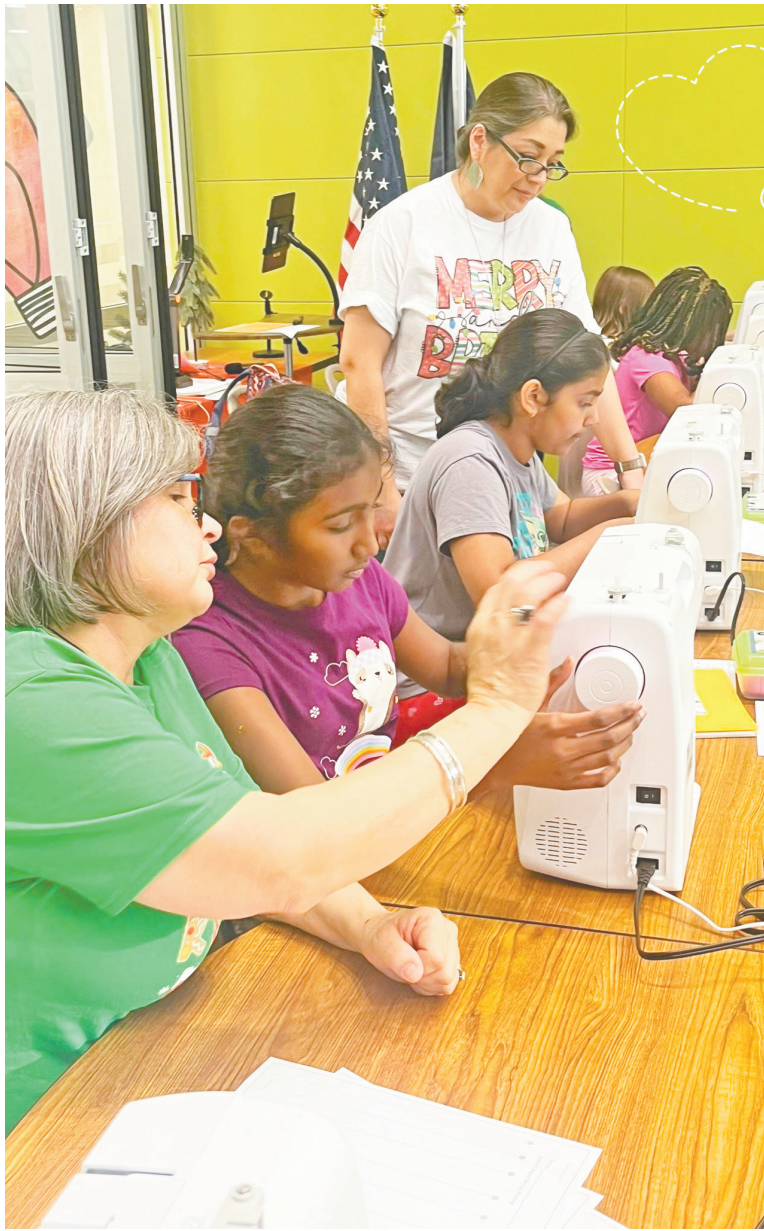
The Amy Campbell Elementary Sewing Club members practiced stitching on the new sewing machines they received with funds from their Katy ISD Education Foundation grant.