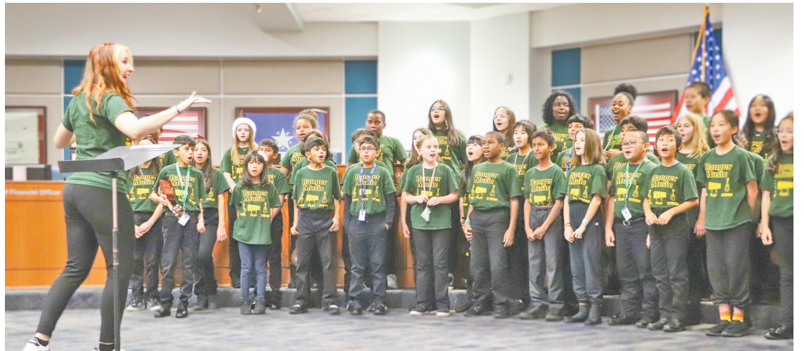
The WoodCreek Elementary choir.