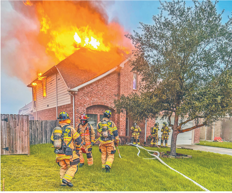
HARRIS COUNTY ESD 48

Firefighters from Harris County Emergency Services District 48, Community Volunteer Fire Department, Willowfork Fire Department/Fort Bend ESD 2, and the Katy Fire Department worked to put out a fire that occurred the morning of Dec. 19 at a house in the 24000 block of Waterline Lane. Crews worked to rescue family pets from the home, and no injuries were reported. Firefighters said the cause of the fire was a lightning strike from morning thunderstorms.