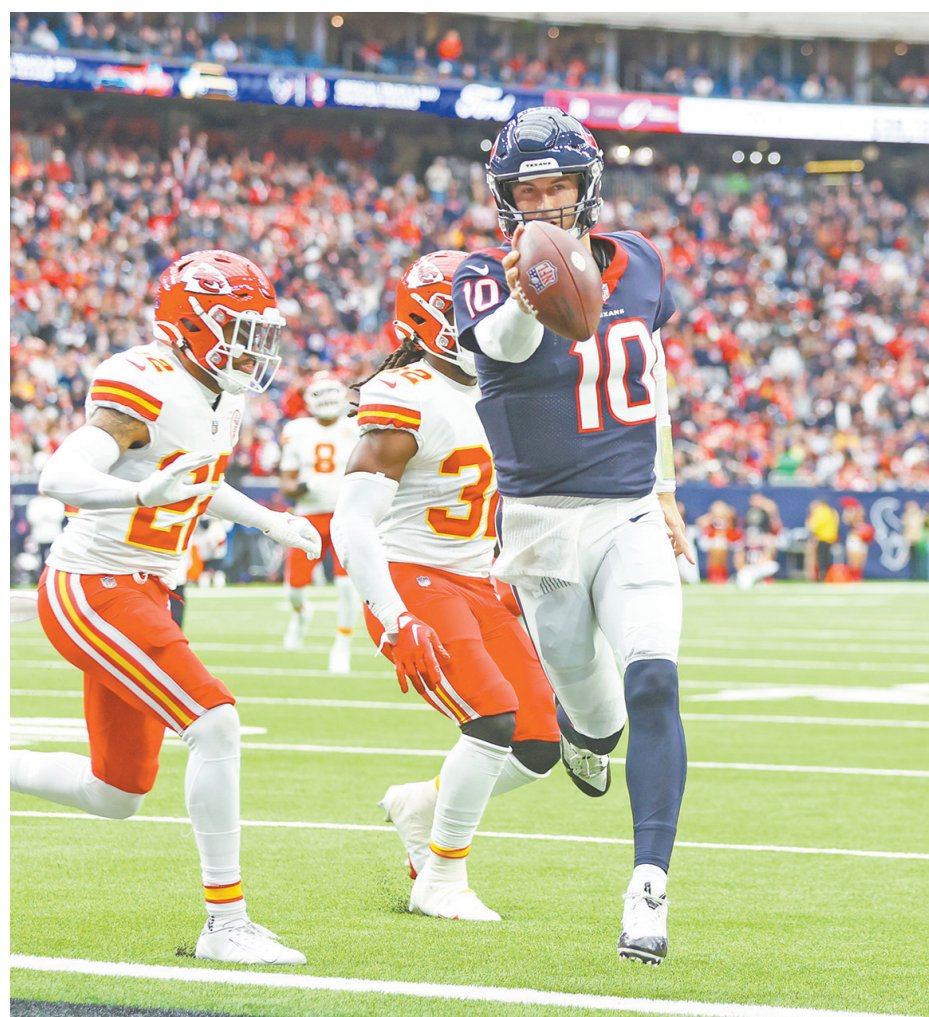
Houston Texans quarterback Davis Mills (10) scores on a 17-yard touchdown carry during an NFL game between the Texans and the Chiefs on Dec. 18, 2022, in Houston. The Chiefs won, 30-24, in overtime.

LOOKING FOR A PET, A HOME OR A JOB? DON'T MISS OUR CLASSIFIEDS!