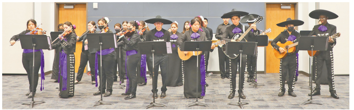
The Morton Ranch High mariachi band.