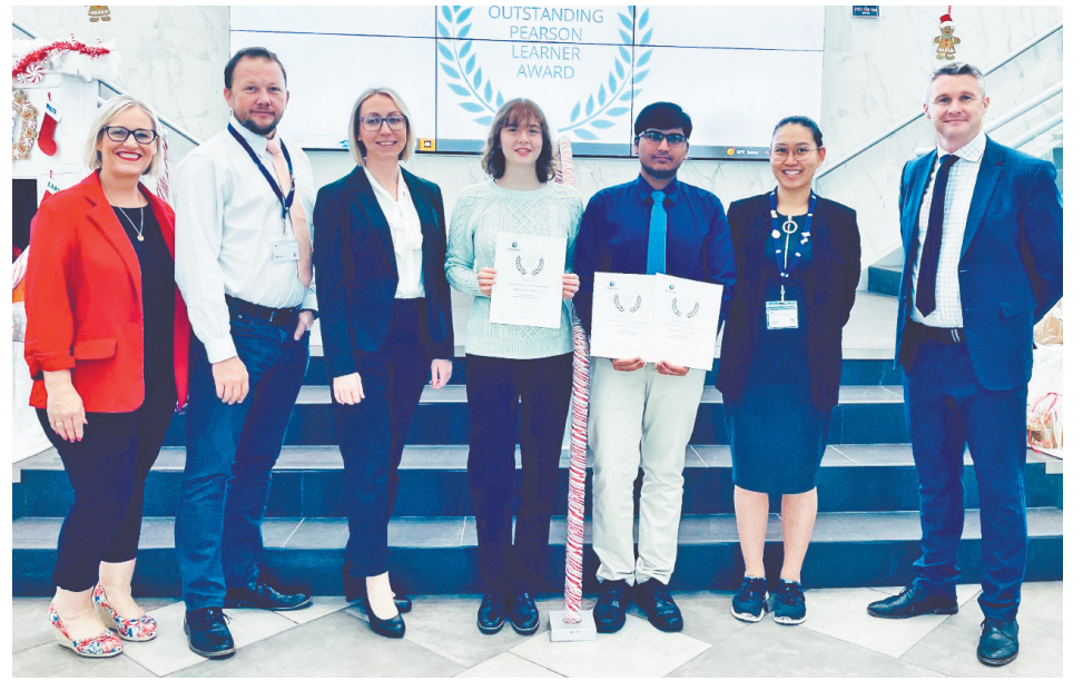
BRITISH INTERNATIONAL SCHOOL OF HOUSTON