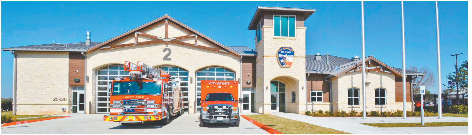
Katy Fire Department Station #2, 25420 Bell Patna Dr.