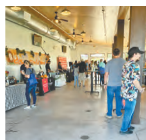
The brew fest wasn't just about beverages, as many hors d'oeuvres were also available for sampling.