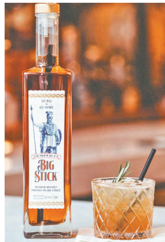
Big Stick Spirits makes and sells bourbon, and donates a portion of its profits to military charities.