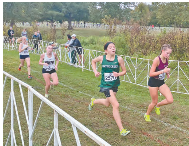
A Mayde Creek cross country runner runs during Friday's state meet.