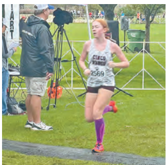
A Cinco Ranch runner finishes at Friday's state meet.