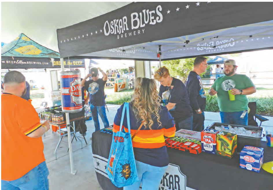
Oskar Blues Brewery was among the breweries with a booth at the brew fest.