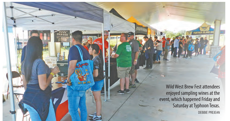
Wild West Brew Fest attendees enjoyed sampling wines at the event, which happened Friday and Saturday at Typhoon Texas.