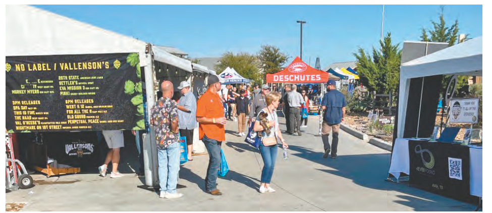
Clear skies and pleasant temperatures Saturday seemed tailor-made for the Wild West Brew Fest, sponsored by the Rotary Club of Katy.