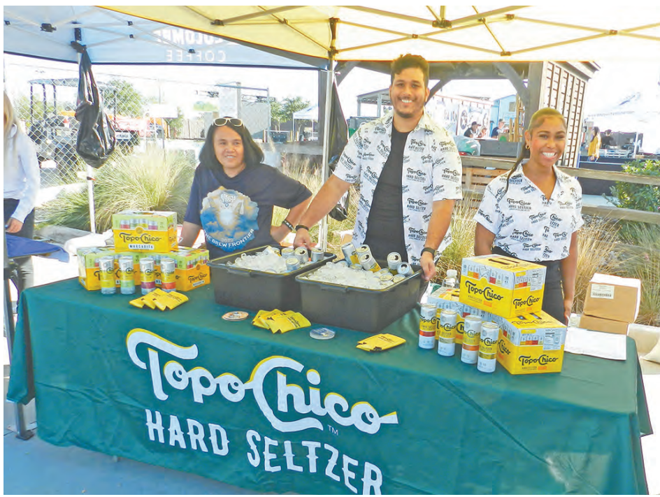
Topo Chico hard seltzer was among the drinks for brew fest attendees to enjoy.