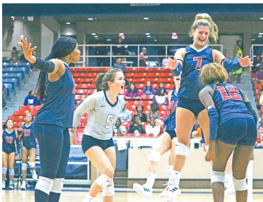
Tompkins players celebrate after a point in the first set during Tuesday's match between Tompkins and Ridge Point at Wheeler Field House.