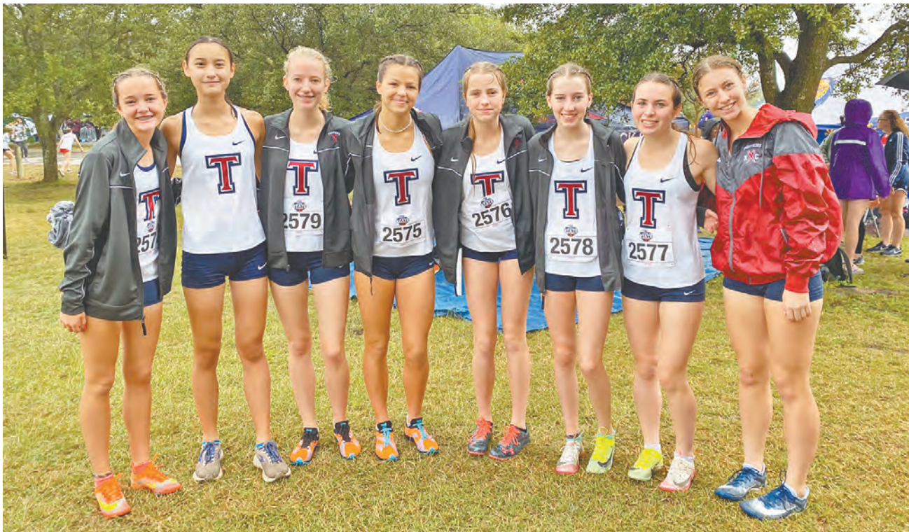
The Tompkins girls cross country team before Friday's state meet.