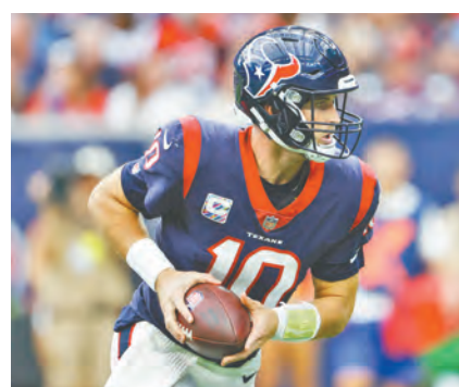
The Houston Texans and quarterback Davis Mills host the Washington Commanders Nov. 20, with a portion of ticket sales benefiting the Katy Lions and the Robertson Elementary PTA.

The Katy Heritage Society will award scholarships at its upcoming regular