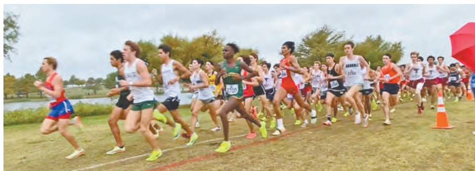
The Tompkins boys take off at the beginning of Friday's state meet.