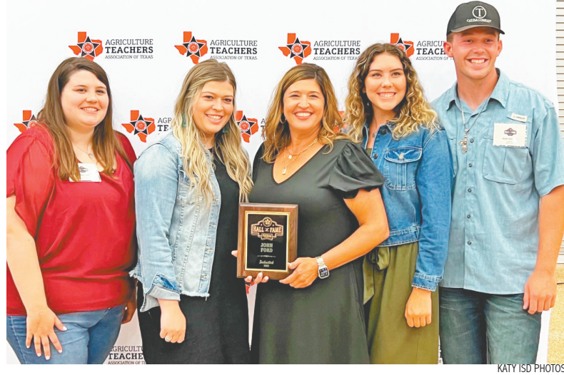
The family of the late John Ford accepts his Hall of Fame plaque.