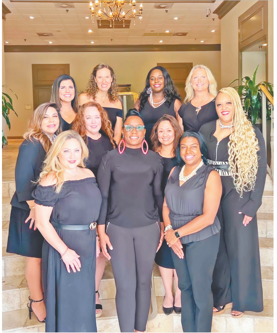
FORT BEND JUNIOR SERVICE LEAGUE

These programs are free and open to the public. For more information, visit the website fortbend.lib.tx.us .