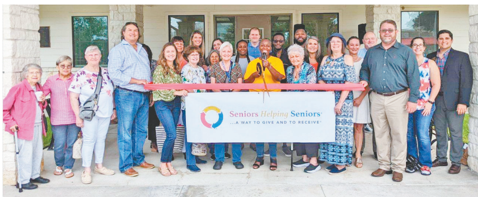
KATY AREA CHAMBER OF COMMERCE

The new Seniors Helping Seniors franchise in Katy celebrated its membership in the Katy Area Chamber of Commerce Monday with a ceremonial ribbon-cutting. The ceremony was staged at the City of Katy Fussell Senior Center.