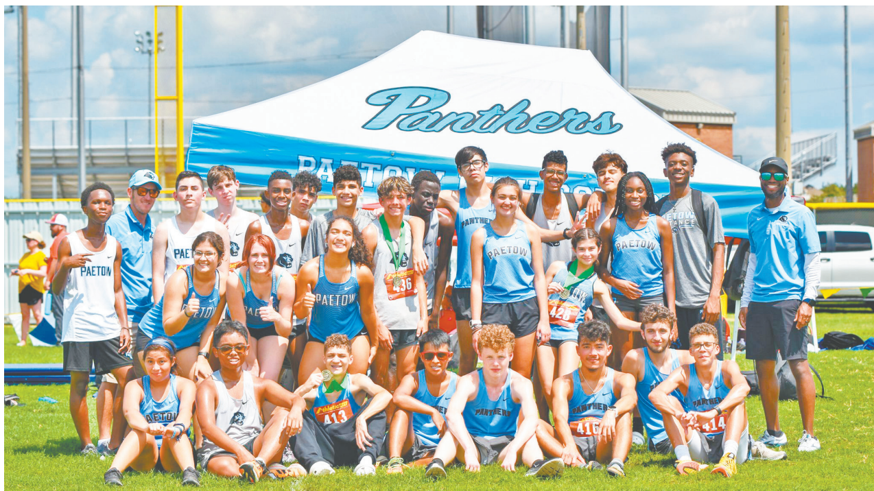
Paetow's cross country team.