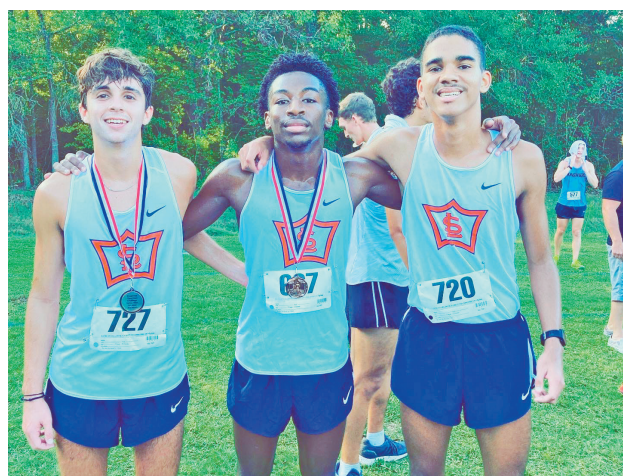
Seven Lakes runners pose for a picture after the Kingwood Classic Challenge.