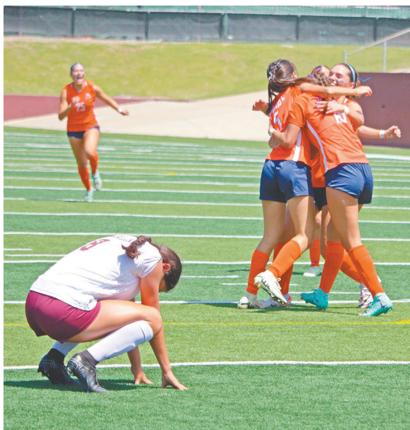
Seven Lakes celebrates a goal during Friday's Region III-6A Semifinal between Seven Lakes and Pearland in Deer Park.