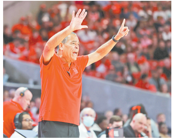
Houston head coach Kelvin Sampson during an NCAA college basketball game between Houston and Wichita State on Mar. 2, 2023, in Houston.

Sampson also became the second Houston coach to collect the honor after Hall of Fame Coach Guy V. Lewis following the 1967-68 season.